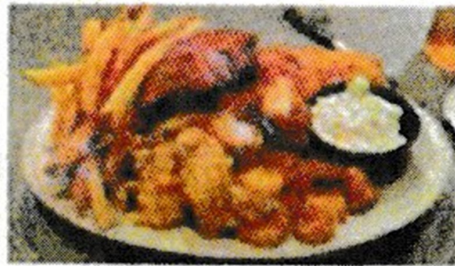
Famous Fish Platters