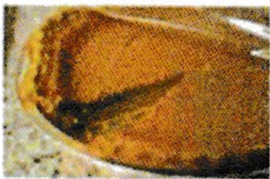
Original Bean Pies