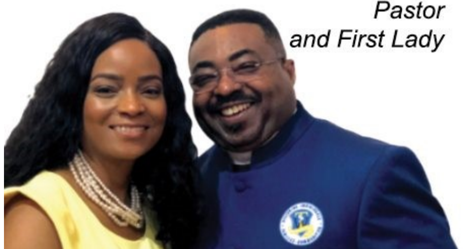
Pastor and First Lady